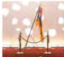
Convention Flag Creator: Eiko Co., Ltd.