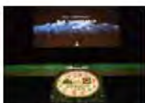
Flower Artwork of the Convention Logo Producer: Matsumoto Hanaichiba Co., Ltd.