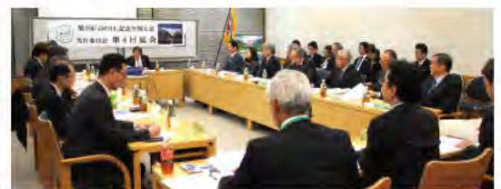
4th General Meeting