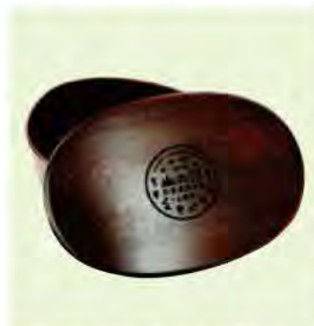
○Kiso Cypress Oval Lunchbox (Sakai Sangyo Co., Ltd.) A curved hinoki lunch box from the Kiso / Narai Post Town