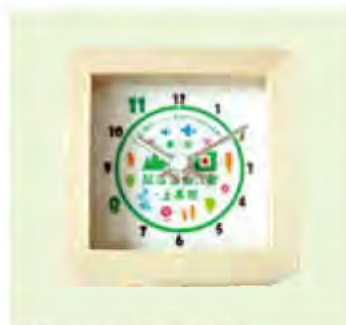
○Mountain Day Clock (Nagano Prefectural Federation of Lumber Cooperatives) A table clock framed with cypress and a lovely design featuring the convention logo on the face.