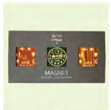
○Lacquered Magnet (Misora Arts and Crafts) Magnets applied with three different lacquers on a wood grain veneer base