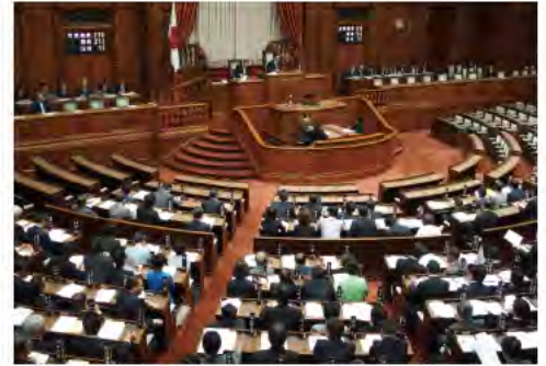
The moment the Mountain Day law was approved in the House of Councilors (May 23, 2014)

The Convention and Parliamentary Association worked diligently as the core drivers of the effort, and on May 23, 2014 the National Holiday Law was reformed by the House of Councilors, with Mountain Day (August 11) being established as the 16th national holiday of Japan.