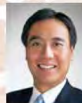
Shuichi Abe Governor of Nagano Prefecture Honorary President of the Organizing Committee for the Inaugural National Ceremony for Mountain Day

Over the 10th and 11th of August in the refreshing summer mountain breeze, graced by the presence of Their Imperial Highnesses The Crown Prince, Crown Princess, and Princess Aiko, a magnificent national ceremony was successfully held, attended by approximately 17,000 guests from inside and outside of Nagano Prefecture, commemorating the new national holiday of Mountain Day.