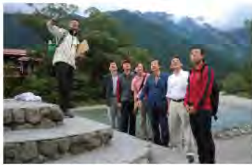
Study camp of the nonpartisan Parliamentary Association at Kamikochi (September 9 - 10, 2013)

Eighty percent of Nagano Prefecture is occupied by forest, and three alpine regions stand towering over an extensive area of this mountainous prefecture (formerly named Shinshu), also duly referred to as the roof of Japan, with Matsumoto City claiming the title of Japan’s representative “mountain city”. Following the establishment of Mountain Day, a joint session of the Parliamentary Association and the Convention was held in March 2015, at which Kamikochi (Matsumoto, Nagano) was expressed as a fitting venue for the national convention commemorating the first Mountain Day. In May of the same year, Nagano Prefecture, Matsumoto City, and the Kamikochi Town Council jointly signed and submitted an invitational request to the Parliamentary Association and Convention for the hosting of the national convention at Kamikochi. In an ordinary general meeting of the Convention, Kamikochi was approved as the venue for the inaugural national convention.