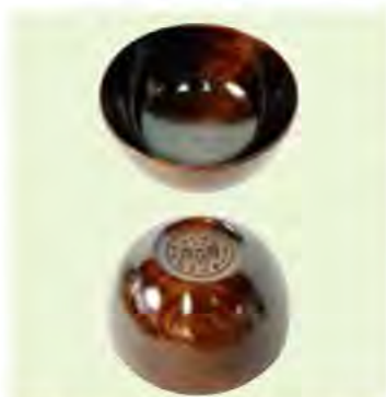
○Lacquered Horse Chestnut Bowl (Sakai Sangyo Co., Ltd.) A beautiful bowl fusing traditional Japanese technique and refined

From May 25 to June 8, a public appeal was made for the production of a souvenir made from Shinshu timber, one of mountains' blessings, featuring the convention logo. A total of 12 companies applied, and the four items below were chosen from a total of 32 submissions. Selection was based on items' ability to produce special emotions related to mountains and Mountain Day, and their size for ease of carrying.